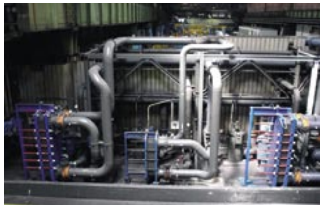
Two M30-DWFG double-wall plate heat exchangers for emulsion cooling of tandem lines.

Since 1998, Alfa Laval has installed more than 50 double-wall plate heat exchangers in Germany, which is noted for its strict environmental regulations. These installations safeguard steel manufacturers that use hydraulic oil cooling against oil contaminating their cooling water or vice versa. More than half of these double-wall heat exchangers are installed at the ThyssenKrupp Steel Number1 rolling mill (KW1) in Bruckhausen.